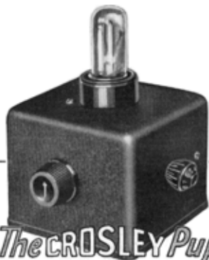
The CROSLEY Pup