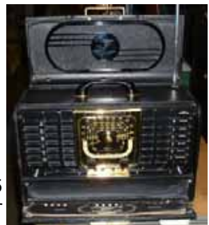
TransOceanic 8G005 Unknown Owner