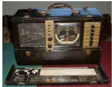
TransOceanic 7G605 "Bomber" Brian Toon