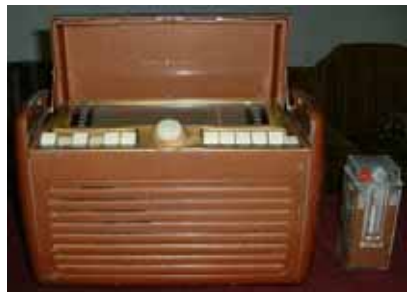
GE 260 w/ rechargeable battery Rudy Zvarich