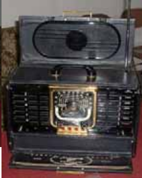
TransOceanic 8G005 Sonny Clutter