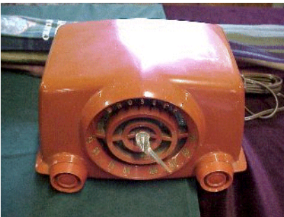
Charlie Kent - Crosley 11-103U