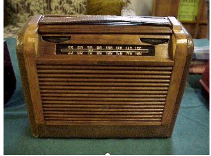
Larry Tobkin - Philco Portable