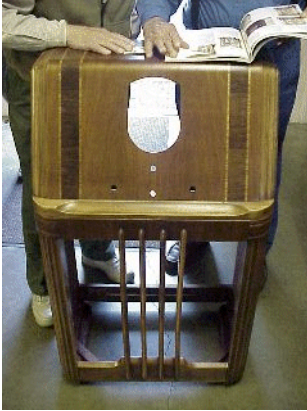
Frank Olberding - Philco 38-3 cabinet

These are the summer projects or acquisitions shown by members at the September meeting.