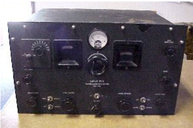
Liles Garcia - Hammarlund 1936 Super Pro