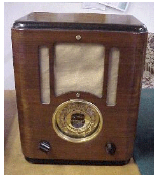
Myron White - 1938 Crosley "Fiver"