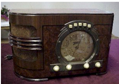
Sonny Clutter - Zenith 6S321