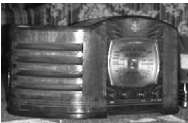
Ed Cook's radio