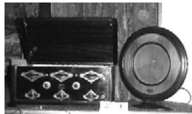
Dick Bixler's radio