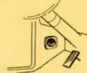
LEFT AND RIGHT KICK PLATES