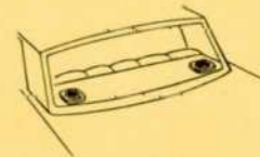
REAR DECK OF CAR