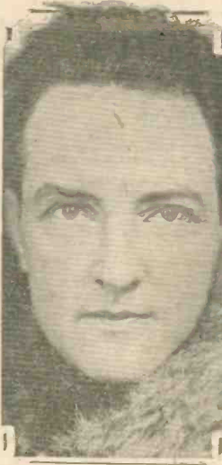
ADMIRAL RICHARD E. BYRD, commander of the South Polar expedition.

pierced the Arctic Circle he began making tests to study the atmospheric conditions of the locality and to determine the spot from which his signals are best received along the Western coast of the United States.