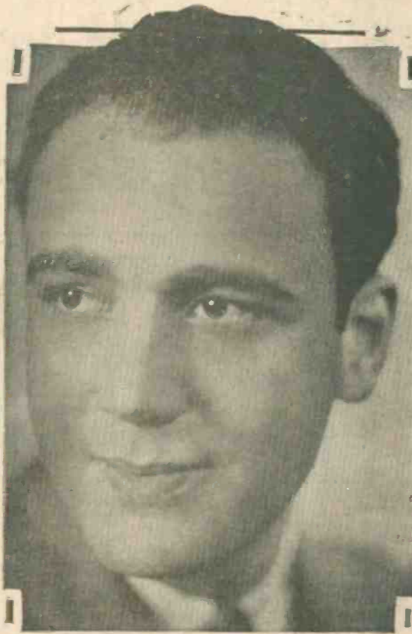
JOHNNY GREEN, one of the musical directors of the Columbia Broadcasting System, who is heard in his own program on Fridays at 9.30 P. M. Mr. GREEN tells something of modern music on the air in the accompanying article.

I'm going after my crusade for excellent musical entertainment with perhaps too much youthful optimism.