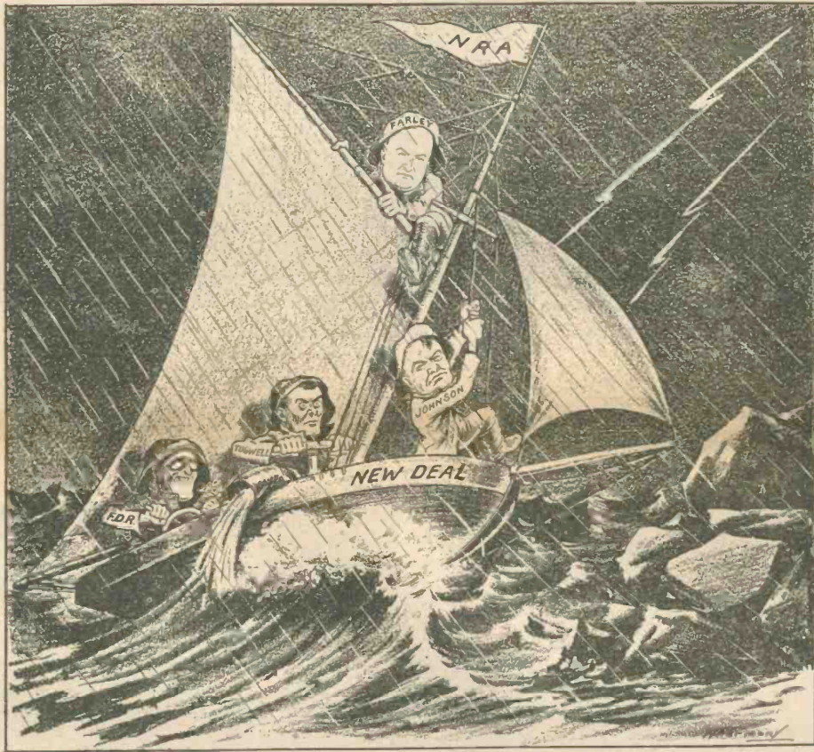
Can They Keep Her Off The Rocks?

Circulation Manager, NOW, No. 34 Court Square, Boston, Massachusetts.