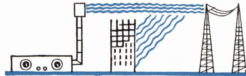
INTERCEPTING SOUND WAVES

thousands of colors above the visible octave and below the visible octave—that probably there were colors still further down the scale below the heat beams that would exhibit even greater penetrating power. Professor Maxwell proved mathematically that these colors did exist. Professor Bell acclaimed them analytically. It remained for Professor Hertz in 1887 to actually discover them.