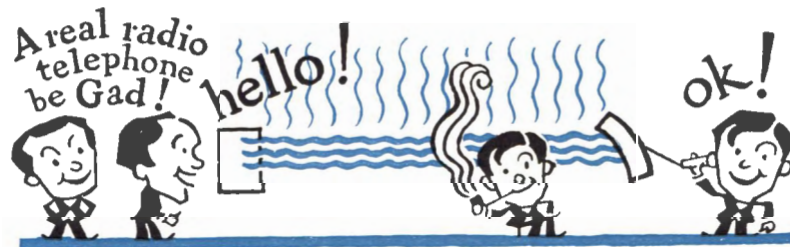
THE INVISIBLE VIOLET RAY

The knowledge gained by the study of the heat beams led to further speculation on the laws of so-called transparency. It was argued that undoubtedly the range of colors were infinite—that there were probably thousands upon