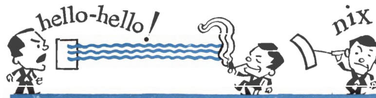
INTERRUPTING SMOKE SCREEN

Efforts were next devoted to study of different colored beams of light and their respective penetrating qualities. It was soon discovered that the seven distinguishable colors seen by the human eye behave differently. Red, yellow, orange, green, blue, indigo and violet were all used as the light beam for transmitting the voice flickering. Violet was easily absorbed—blue was a little better, and so on down until red was found to be the best of all. The flickering red beam actually penetrated thin smoke and haze, while the violet beam was completely absorbed.