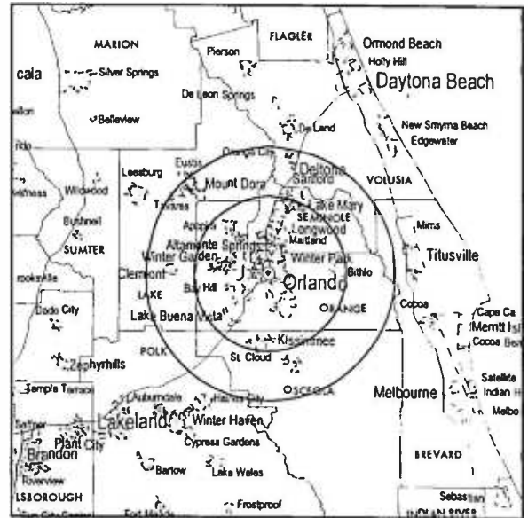
A sample map from the new facilities atlas: Coverage for WMMO Orlando, a 38-kw drop-in signal.

"After months of research at the FCC, and checking with countless other sources, we ended up producing maps for 1,332 stations for the new book. That's up from 1,063 stations we had maps for in the original book," said Anderton, who added, "Back in 1989 and 1990, most of the 'experts' were saying that what was on-the-air then was all we'd ever see. Our research tells a different story. Not only have additional 80-90 drop-ins been completed, but as radio has boomed since 1992, entrepreneurs have found increasingly clever ways to bring new signals into existing markets."