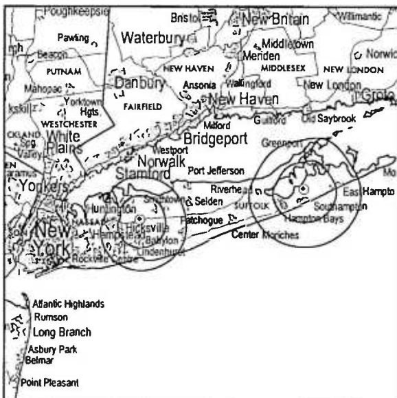
The atlas shows simulcast facilities together. Here, WBAB and WHFM on Long Island.

Facilities atlas users can quickly determine the number of signals which comprise the FM band infrastructure in each market, and determine the relative coverage of each signal.