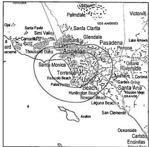
Coverage for KLAX, which moved from a Long Beach tower site to the west side of Los Angeles, thereby becoming a major LA operation.