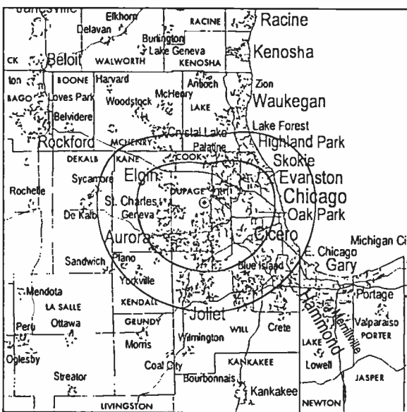
Another sample map: WYSY's Class B move-in signal from the WMAQ-AM tower in Bloomingdale, IL.

Anderton's research also finds the average number of FM stations per market up significantly since 1990. The average major market now has 13.2 stations, up from the 10.8 station-per-market average five years ago.