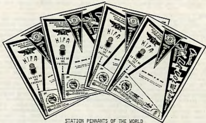
STATION PENNANTS OF THE WORLD

Other stations can now be heard over only a fraction of the area they once served. The FCC did the country a disservice by constricting the cultural appeal of these stations to smaller areas, while at the same time opening up local areas to local coverage. Provincialism reigns again on the radio waves! Wouldn't it be great if stations with unique formats could be allotted a second nighttime frequency in the new band, above 1600 KHz, to take advantage of the greater skywave characteristics of the higher frequencies? I can hear the ID now ... a bit faint and fadey, but still clear: "You're listening to the Nation's station, WLN Cincinnati, now 700 and 1700 on your dial ..."