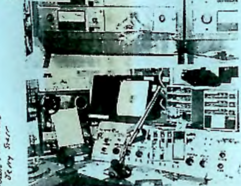
Radio Records Sandy Shore