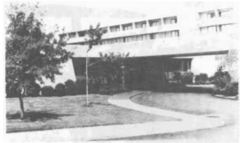
(Above) Northlake Hilton, Convention HQ