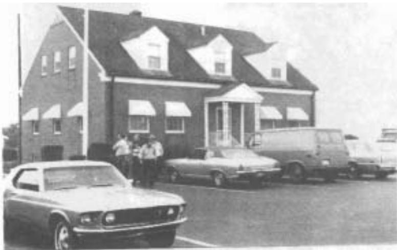
FCC Monitor Station Powder Springs, Georgia