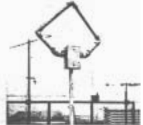
Completed antenna built out of PVC.