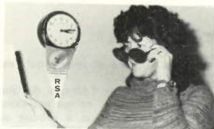
LILIANA PALETTA — e as suas curiosidades há muito que fazem parte da programação da Secção Portuguesa.