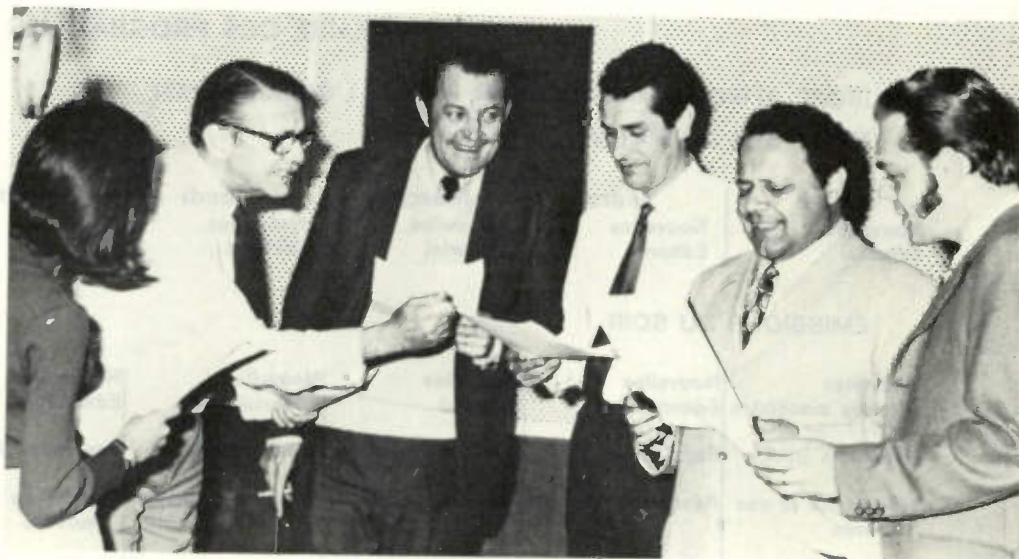
Parte do elenco do Rádio Teatro durante um ensaio dirigido por Carlos Cotrim.