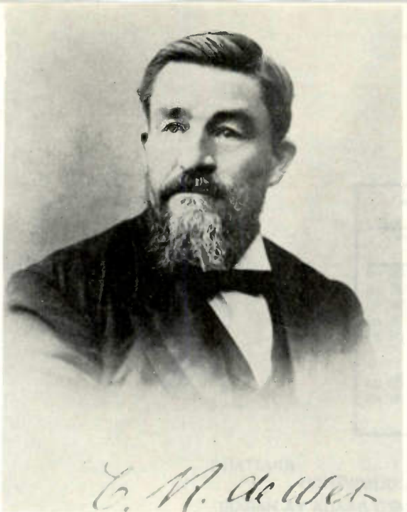
Burengeneral Christian de Wet