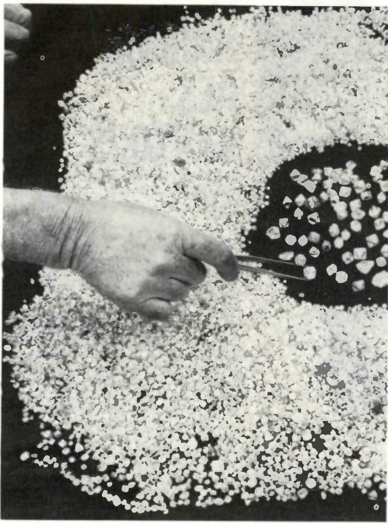
Une sélection de diamants de la mine De Beers à Kimberley.