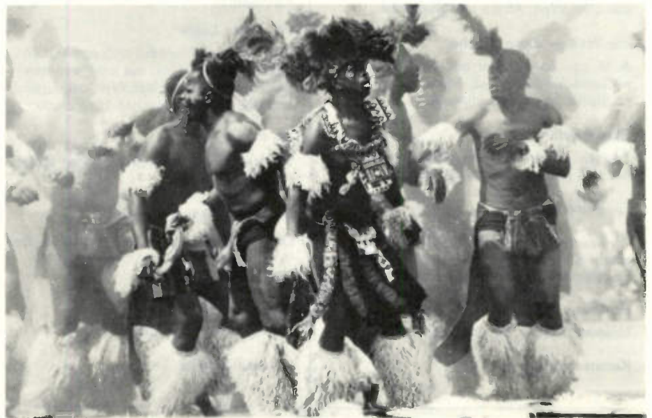
A traditional Zulu Warriors' Dance

There are seven major Bantu peoples in South Africa, each comprising numerous tribes and clans, each differing widely from the other Bantu nations. There are the Xhosa of the Transkei; the Zulus in Zululand and Northern Natal; the Venda of the Northern Transvaal; the Tswana of the Western Transvaal — there are more Tswana in South Africa than in Botswana; the North and South Sotho, who live mainly in the Orange Free State; and the Tsonga of the Eastern Transvaal. And, as their languages, cultures and traditions differ widely, so, too, does their music. But though the music differs from nation to