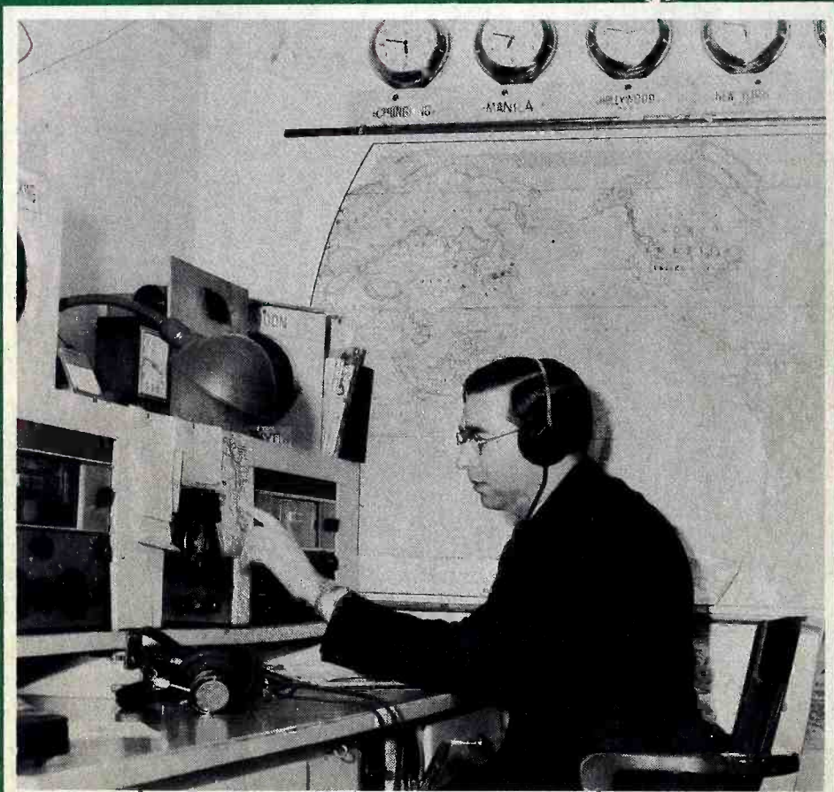
NBC's FAR EASTERN LISTENING POST IN NORTH HOLLYWOOD, CALIF.

COMPLETE GUIDE-BOOK FOR SHORT-WAVE LISTENERS