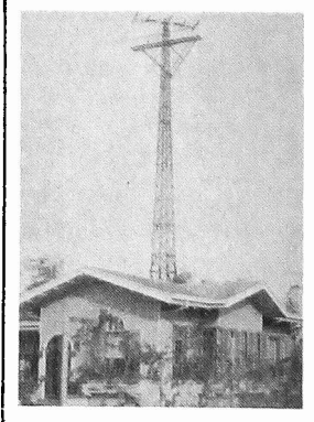
KAlAG'S Residence and Rotating Beam Aerial

(14,000-14,400 Mcs.) (E.S.T.) NORTH AMERICA (E.S.T.)LASKA K7CBF (14.23) at 11 p.m. (RW). K7HAR sent white card with large red call letters outlined in blk. ALEUTIAN ISLANDS W6EXE/K7 qsl'd from his home in Oak-