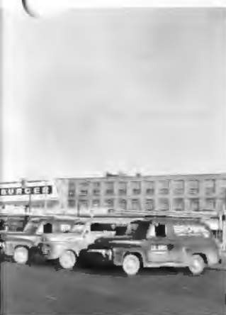
Service trucks ready for service operations.