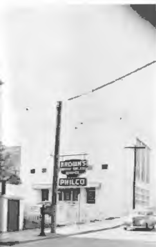
Service Center grosses four times more than it would service exclusively.

Your electronic and appliance service parts and accessory business is a big business which you can make profitable and exciting for yourself by being good salesmen, good advertisers and good merchandisers.