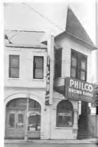
Brown's Sales and Service from service alone for did when Brown offered

2. Desire and ambition to go further and assume the added responsibilities that increase in ratio to expansion of business takes a decided drop in this group. But this attitude is quickly corrected when a complete concise business program is laid out for the individual.