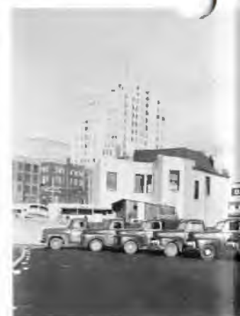
Brown's fleet of service vehicles on a busy day of business