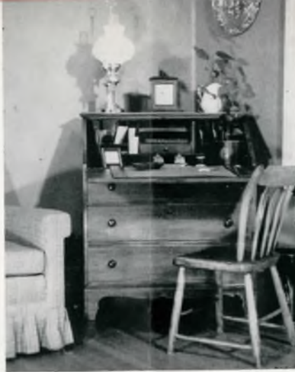
AN ANTIQUE DESK, original varnish removed, now has a beautiful natural pine finish. The white pitcher is Iron Stone Pottery; the chair in the foreground is a sturdy, refinished Slant Back Arrow Chair, one of a pair. Although the spindles are worn half-way through from use, the chairs are as practical as they are ornamental.