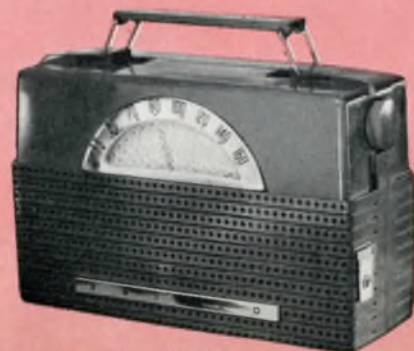
PHILCO PORTABLE Radio Model 662.

This is the happy refrain in an air-conditioned home. Room air conditioners screen out excess summer dust and dirt—as well as flies and mosquitoes—cutting way down on time spent doing household chores.