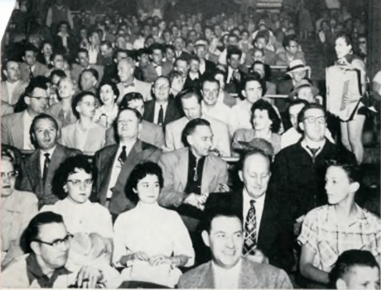
ONE OF THE GROUPS of Philco employees attending the benefit baseball game at Connie Mack Stadium. Other groups at the game are pictured on this page.

Great numbers of Philco sports lovers attended a shirt sleeve outing at the annual benefit game for the Junior Baseball Federation of Philadelphia at Connie Mack Stadium June 29. In spite of a rain that caused a 41-minute delay and limited action to seven innings in the clash between the Athletics and Phillies, the enthusiasm of the crowd was undampened.