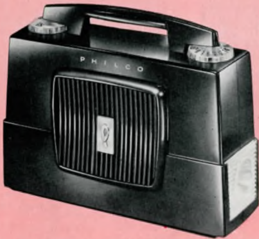
PHILCO PORTABLE Radio Model 663, the newly styled radio-flashlight combination in a wide range of favorite colors.