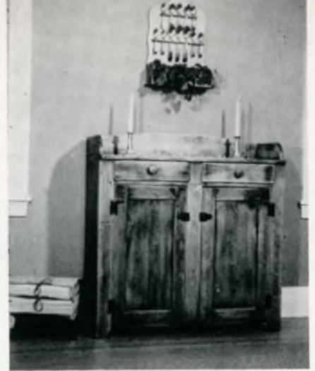
WHEN THE ALLENS bought this "Kitchen Cupboard With a High Counter Top," one of the drawers was so badly broken it required a replacement which needed to be "antiqued." The candlestick holders are of old brass, while over the cabinet is a spoon rack with very old German silver in it.