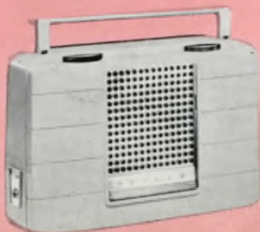
PHILCO PORTABLE Radio Model 660.

The first portable radios to include a built-in flashlight have been introduced by Philco at distributor meetings across the country.