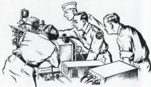
PHILCO TECHREP FIELD ENGINEERS, WHO ARE HIGHLY SPECIALIZED RADAR, RADIO, COMMUNICATIONS AND REFRIGERATION EXPERTS, ARE SUPPLEMENTING ARMED FORCES TRAINING ACTIVITIES AT MILITARY INSTALLATIONS THE WORLD OVER.