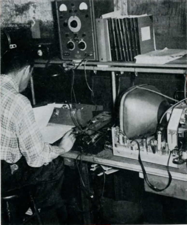
1. Field Engineering Laboratories at Plant 16 checking engineering design model receivers to see that they have attained the objectives set up for them. This is also done with pre-production model samples to insure that the design objectives are met and will be maintained in production. Competitive receivers are checked in this manner, also, to have specific measurements of our superiority.