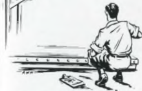
PHILCO MAINTAINS A STAFF OF PACKAGING EXPERTS EXCLUSIVELY EMPLOYED IN DESIGNING AND TESTING PACKING MATERIALS USED IN SHIPPING PHILCO PRODUCTS.