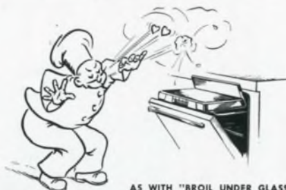
AS WITH "BROIL UNDER GLASS", THE NEW PHILCO "JIFFY GRIDDLE" FEATURE HAS BEEN ENTHUSIASTICALLY HAILED BY RENOWNED CHEFS.