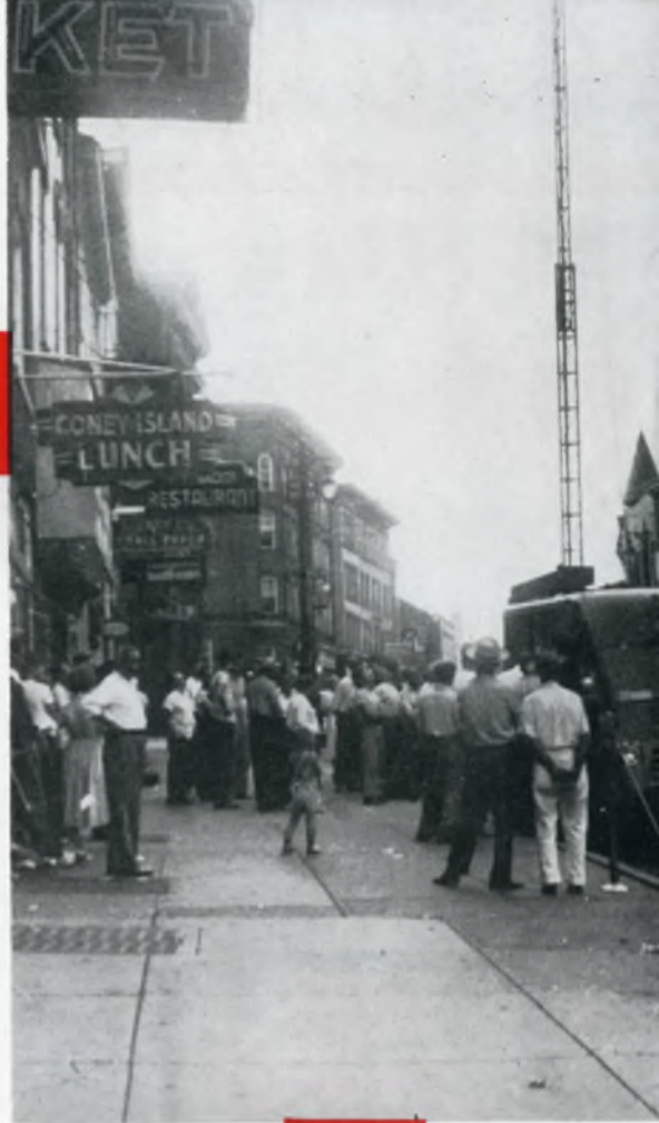
3. With receivers OK under these tests, the mobile laboratories take over and try the receivers in the various troublesome signal areas.