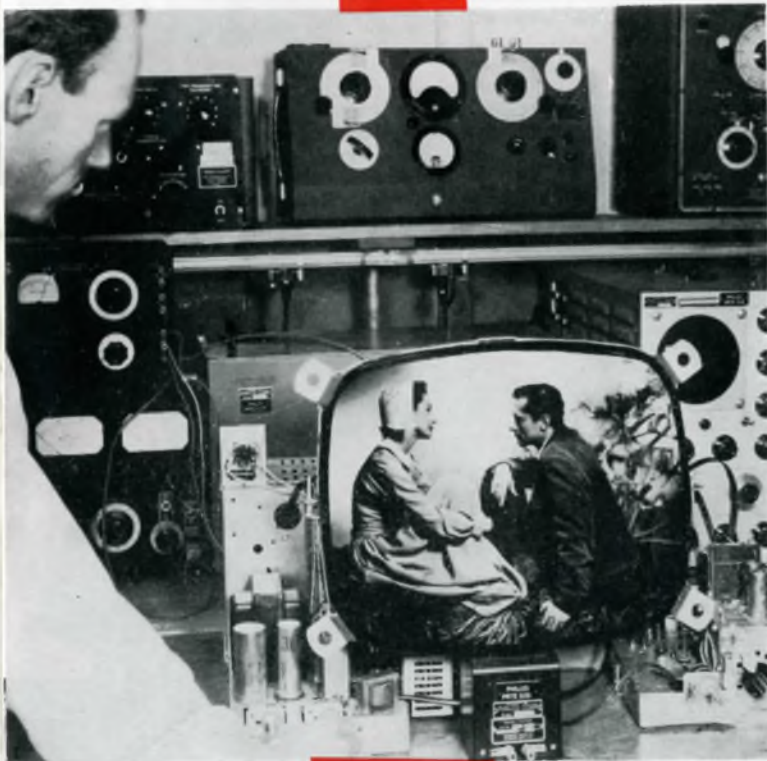
6. Everything possible has ► been done to insure delivery to you of a product which can be first in quality, first in performance, and first in value.

It would take many issues of the NEWS to tell you of the months of work of the design departments which must be done before you are given the task of building the new television and radio models.