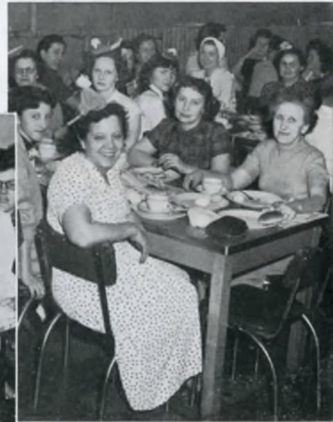
▲ ST. PATRICK'S DAY is celebrated by a party in the Croydon Cafeteria given by the Television Assembly Section of Dept. 75.