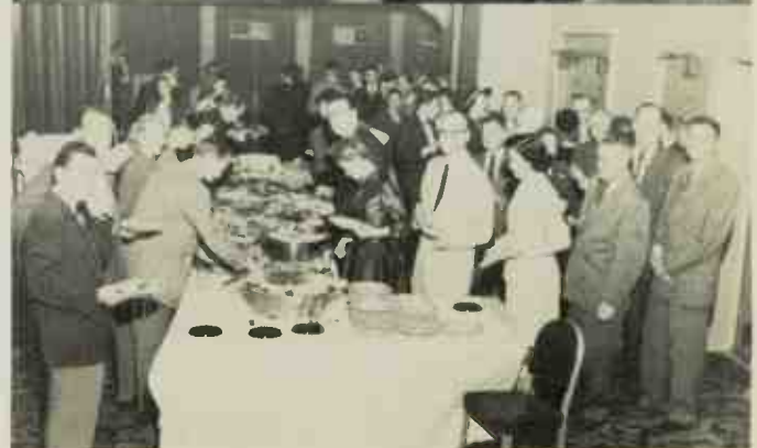
Taken at a recent dealer meeting held in Dallas, Texas, by The Schoellkopf co., Hoffman distributors in that area. The caption for the center picture is on the banner . . . "no eye strain."