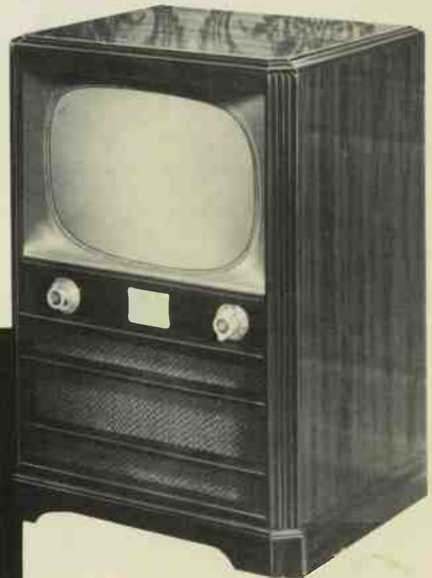
21 inch "king size" console, Model 21M300