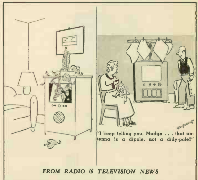
FROM RADIO & TELEVISION NEWS

Billboard promotion is also planned to back up the Hoffman TV campaign. Hoffman dealers will also sponsor the popular Friday night TV show, Sportsfolio.