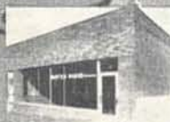
ATLANTA STOCK BRANCH 1133 SPRING ST. N.W.