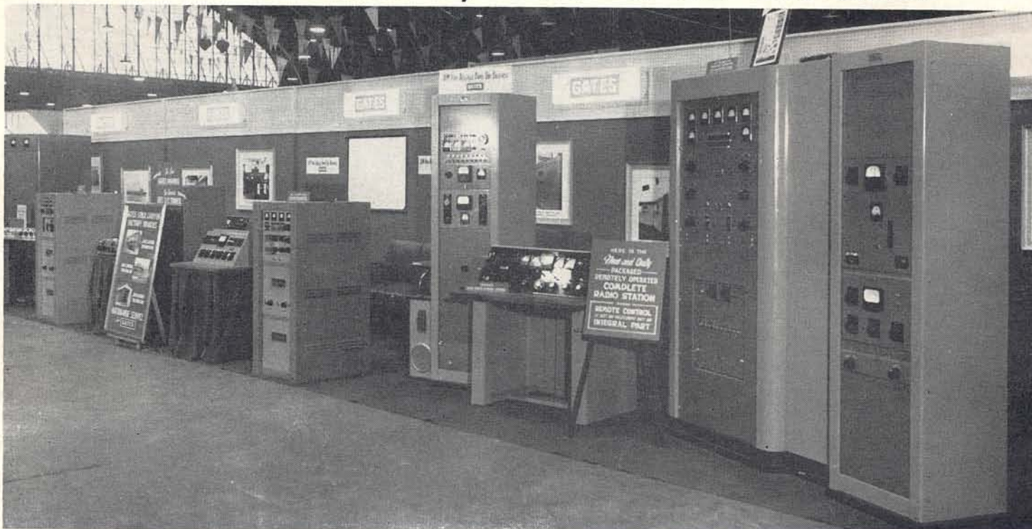
The completely remote controlled 250 watt radio station as displayed at the IRE convention in New York, is shown in the right foreground. To the left is the CMG-1 250 watt communications transmitter. Beyond that is the new BCA-250 250 watt standby transmitter, and beyond that is the new Yard studio console. Part of the 500 watt VHF TV transmitter is shown in the extreme left.

A completely remote controlled 250 watt radio station actually operating and "on the air" working into a dummy antenna was displayed by Gates Radio Company at the recent IRE Convention at the Kingsbridge Armory in New York City. The remote controlled radio station is a brand-new product in the complete line of Gates AM broadcast equipment and was one of the main attractions to broadcasters at the convention.