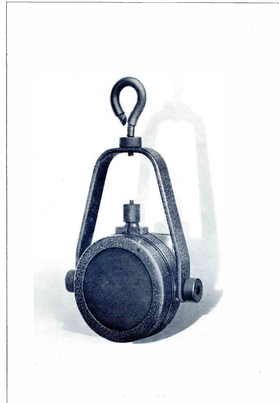
For suspending the microphone from the ceiling or other overhead support the mounting shown above is provided. Microphone and mounting in this design will be supplied finished either in oxidized bronze or black crinkled lacquer.