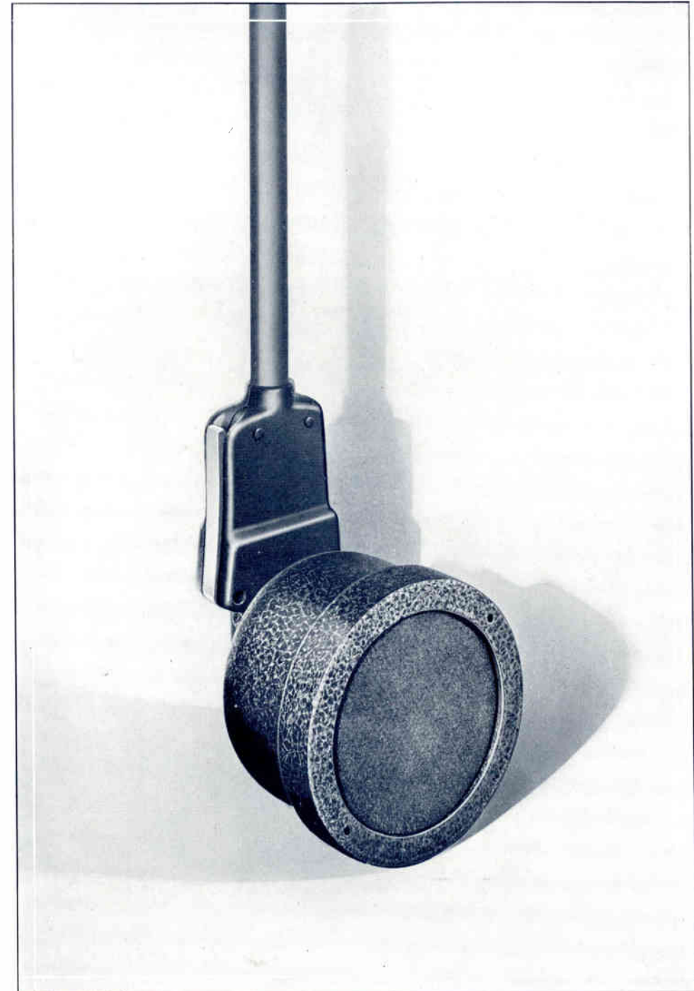
Unmounted microphone showing jack in position.