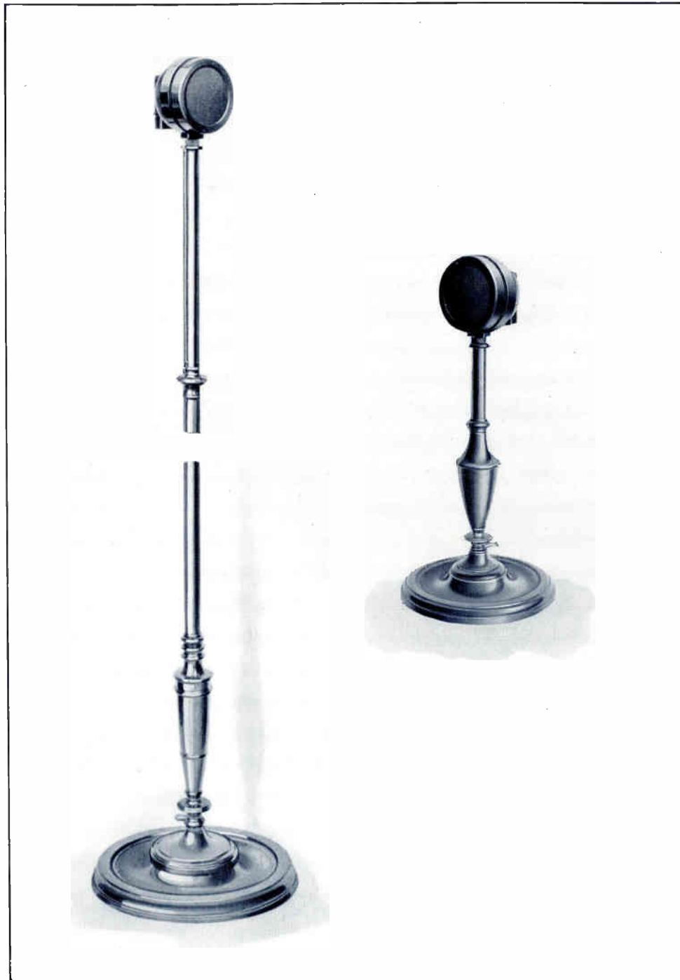
Microphone mounted on floor and on table type pedestals. The Moving Coil Microphone being inherently rugged and insensitive to ordinary local vibration, elaborate spring suspensions or other cushioning devices familiar in ordinary mountings, are unnecessary. Microphone and mounting are furnished in oxidized bronze finish.