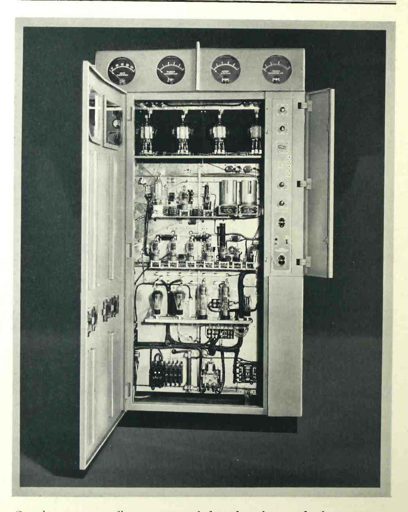
Complete access to all apparatus, including the tubes, in the front section is gained through the main front door