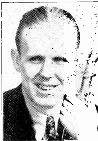
MICKEY GILLETTE KGO—SAXOPHONIST