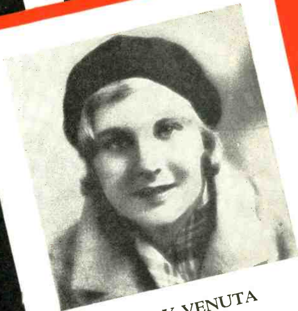
BENAY VENUTA Popular NBC-KPO Blues Singer

THE LEADING RADIO GUIDE OF THE PACIFIC COAST