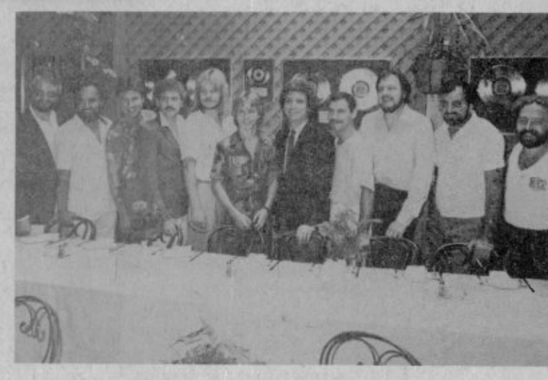
A&M's Superstars, Styx, receive gold single for Babe and platinum for Paradise Theatre at wrap up of their recent cross Canada tour. A&M's head office laid on a special reception/presentation.