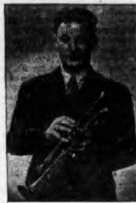
CHARLES MARGULE Top-Notch Radio Artist

The second annual contest for orchestral compositions by native-born compos-