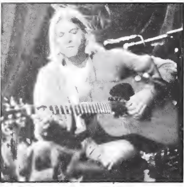
#1 ALBUM: Nirvana