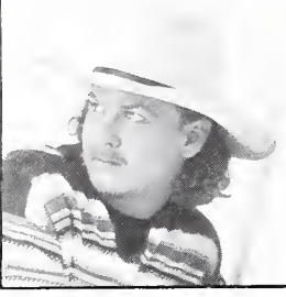
#1 SINGLE: Tracy Lawrence