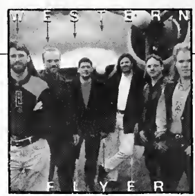
#1 INDIE: Western Flyer #35