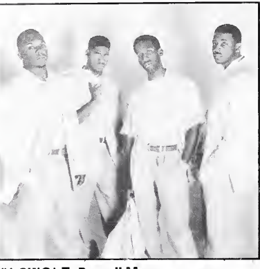
#1 SINGLE: Boyz II Men