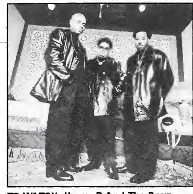
TO WATCH: Heavy D And The Boyz