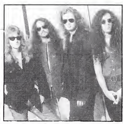
TO WATCH: Megadeth