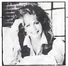
TO WATCH: Reba McEntire #33