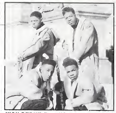
HIGH DEBUT: Boyz II Men