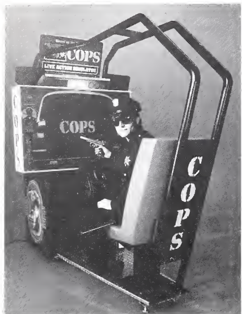
Atari Games' Cops

CHICAGO—Time Warner Interactive (Atari Games) recently introduced Cops, its new interactive simulation of the popular television show. The TV series is in its sixth season and went to national syndication last year, airing daily and ranking among the top five syndicated shows.