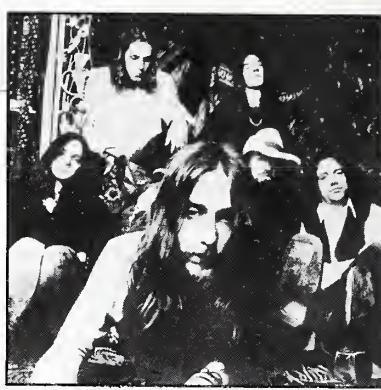
HIGH DEBUT: Black Crowes