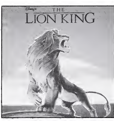
#1 ALBUM: Lion King