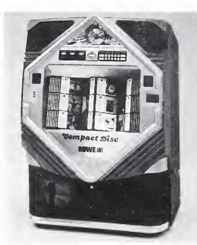
Rowe's LaserStar Diamante CD-100E

CHICAGO-Smooth lines, contemporary design, impeccable sound reproduction and unlimited earnings potential are just a few of the attributes of a hit selling machine, and they are all contained within the new Rowe LaserStar Diamante CD-100E jukebox. This new model was unveiled by Rowe International at its recently held Annual Distributor Conference at the Swan Hotel in Orlando, FL.