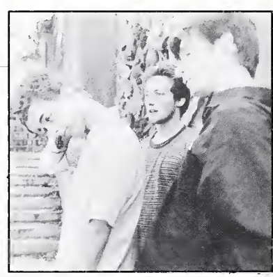
TO WATCH: Green Day