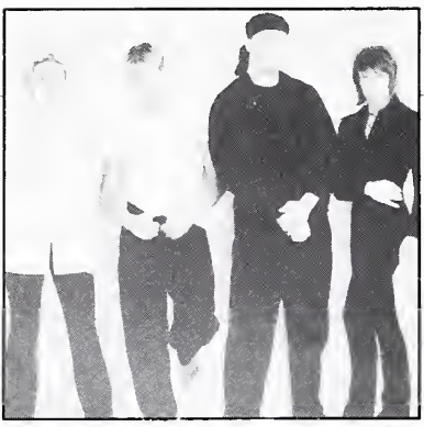
#1 SINGLE: Ace of Base