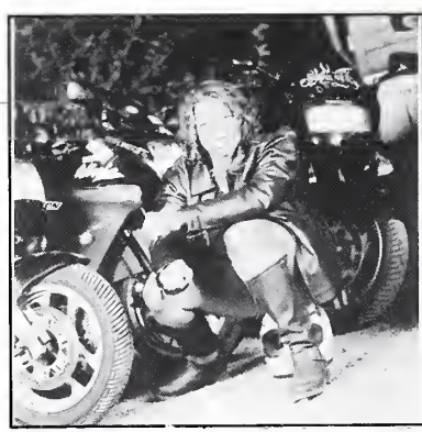
TO WATCH: Queen Latifah