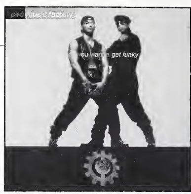
HIGH DEBUT: C & C Music Factory