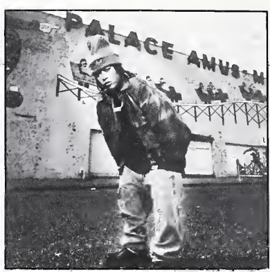
HIGH DEBUT: Da Brat