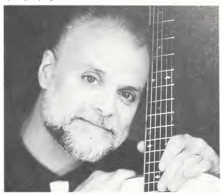
Lenny LeBlanc's first Positive/Christian Country single, "A Carpenter's Son," leaped to #14 in its second week on the charts.