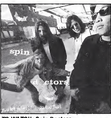
TO WATCH: Spin Doctors