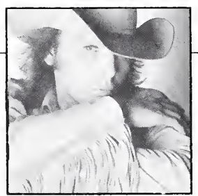
TO WATCH: Dwight Yoakam #32