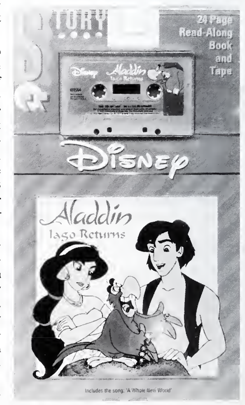
Disney Records' latest Storyteller, Aladdin, lago Returns.

What next?...well, how about a Broadway musical based on...a hockey team?!