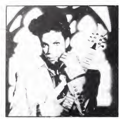
#1 SINGLE: Prince