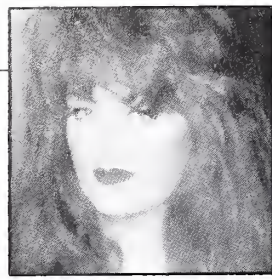
#1 SINGLE: Wynonna