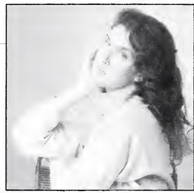
TO WATCH: Celine Dion