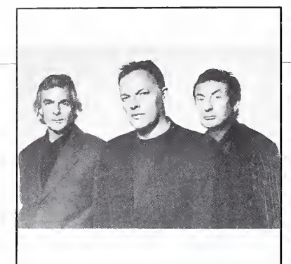
#1 ALBUM: Pink Floyd