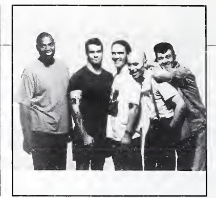
HIGH DEBUT: Rollins Band