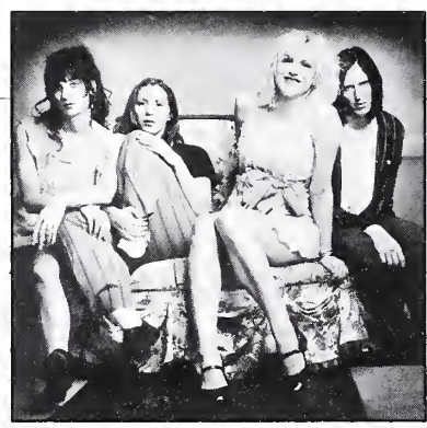
TO WATCH: Hole