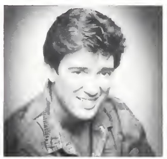
with an even bigger message.