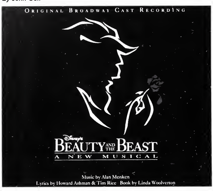
Beauty And The Beast Broadway Cast Recording.

LEAVE IT TO DISNEY to come up with something different. This time it's reversing a long entrenched trend. We've all heard of making a movie from a Broadway musical...well, Walt Disney Records has joined with the company's new arm, Walt Disney Theatrical Productions—formed for the specific operation of mounting productions for the stage—and its premiere production makes a Broadway musical out of one of their films, Beauty And The Beast. O.K., Andrew Lloyd Webber did it with Sunset Boulevard, but that's with people...here we're looking at candelabras, pots, inanimate objects and half man-half beast, to the stage from animation.