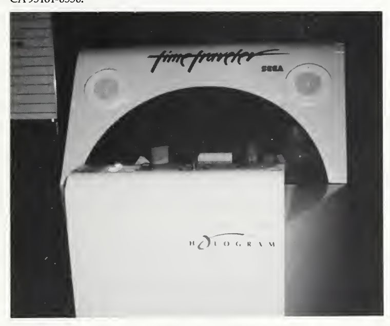
Time Traveler Hologram

an extensive p.r. back-up program in conjunction with its release. Further information may be obtained through factory distributors or by contacting Sega Enterprises, Inc., 2149 Paragon Drive, P.O. Box 610550, San Jose, CA 95161-0550.