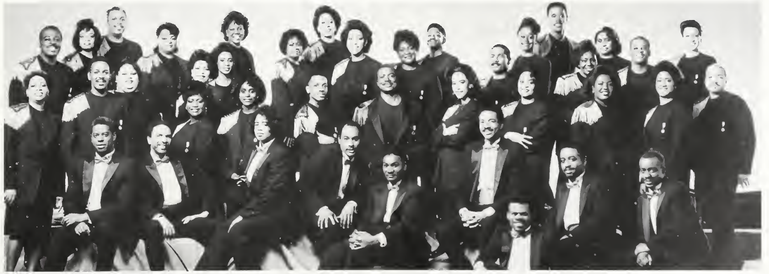
The Sounds of Blackness