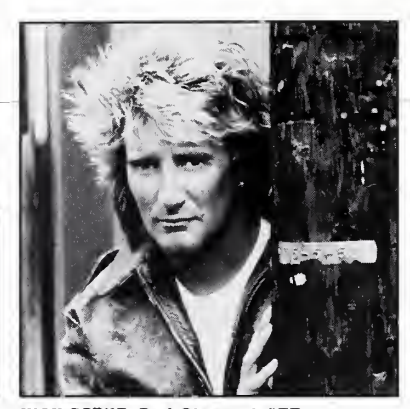
HIGH DEBUT: Rod Stewart #75