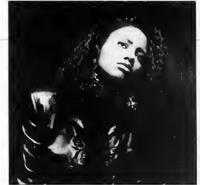
TO WATCH: Lalah Hathaway #58