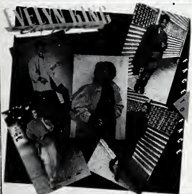
FACE TO FACE — Evelyn Champagne King — RCA AFL 1-4725 — Producers: Various — List: 8.98 — Bar Coded

Using the same production team that made Shalamar's latest LP a big crossover hit, King's sixth release should receive a similar reception from radio for its bristling pop-funk tunes. With last year's success of "Get Loose," which reached the Top 5 on the Cash Box Black LP Charts, there has been great anticipation for a new King record. "Face To Face" will not disappoint any of her old fans and may well attract new ones hip to the current funk trends. The upbeat, punchy "Action," and "Shake Down" — draws from both new music as well as the singer's trademark funk roots. The "Champagne" nickname is back and the old bubbly is as inebriating as ever.