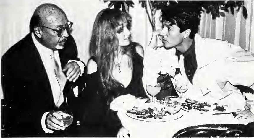
THE ONE AND ONLY — Atlantic Records recently held a party in New York to celebrate the release of the original cast recording of the Tony award-winning musical, "My One and Only." Pictured above at the gathering are (l-r): Atlantic chairman Ahmet Ertegun, and "My One and Only" stars Twiggy and Tommy Tune.