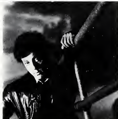
BILLY JOEL (Columbia 38-04259) An Innocent Man (5:16) (Joel Songs — BMI) (B. Joel) (Producer: P. Ramone)

Joel goes a-crooning with the third single release from his current album. A change from the energetic chart-toppers still garnering airplay, the LP's title track is in keeping with Joel's 60s-tribute theme. Sounding soulful with a suburban lilt, Joel takes a cue from the Righteous Bros. In a performance that recalls Joel's previous "Until The Night." It's an affecting mellow mood piece just right for the upcoming hectic holiday schedule. On paper a bit lengthy for a ballad, but it looks to stand the airplay test for adult contemporary, Top 40 and AOR. A welcome change of pace for the singer/songwriter.