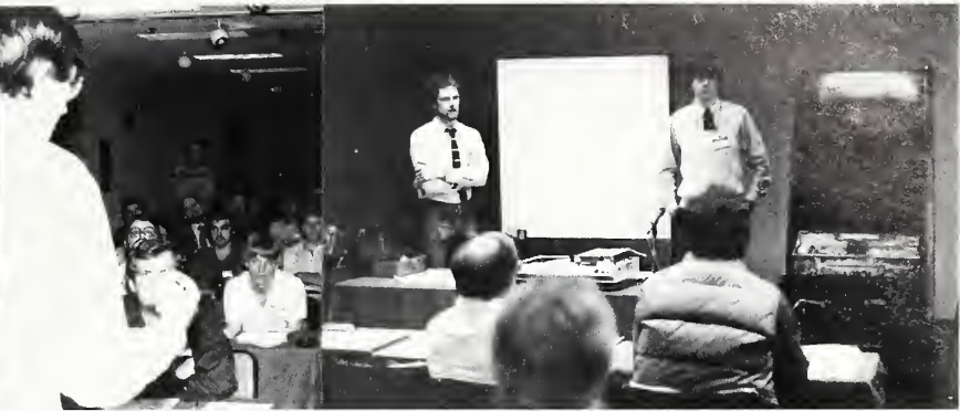
LASER TROUBLESHOOTING — Nearly 100 operators and technicians from six states recently attended a laser disc service seminar sponsored by Hanson Distributing of Bloomington, Minnesota and Cinematronics. Pictured in the accompanying photos are