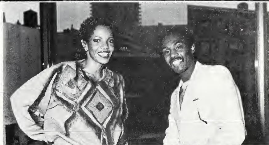
STRIKING A POSITIVE VOTE — Capitol recording artist Melba Moore (l) and Kool of De-Lite/Polygram recording group Kool and the Gang (r) joined many major artists who came out in support of the recent Voting Is Important (VIP) nonpartisan voter registration marathon that took place at New York's Lincoln Center. The marathon was sponsored by the Black Radio Council of New York and was supported by the Woman's Network, the Urban Coalition and the Alliance of Latin Artists.