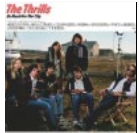
THRILLS So Much For... Virgin (584964)