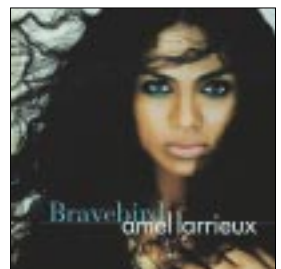
AMEL LARRIEUX Bravebird Bliss Life (1)