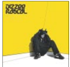
DIZZEE RASCAL Boy In Da Corner XL (10600)