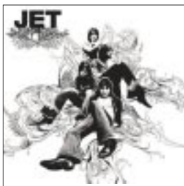
JET Get Born Atlantic (62892)