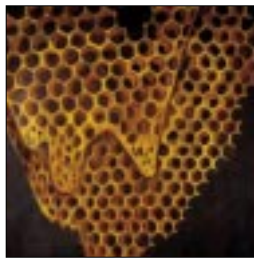
Telefon Tel Aviv