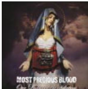
Most Precious Blood