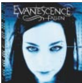
EVANESCENCE Fallen Wind-Up (13063)