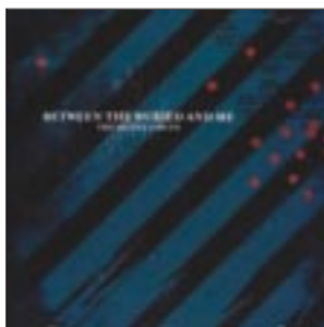
Between The Buried...