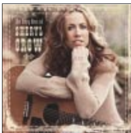
SHERYL CROW Very Best Of... A&M (152102)