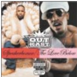
OUTKAST Speakerboxxx... Arista (50133)