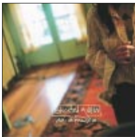
ANI DIFRANCO Educated Guess Righteous... (34)