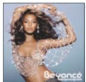
BEYONCÉ Dangerously In Love Columbia (86386)