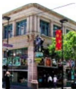
There's no dis-'Putin!

All the big Clear Channel stations tend to have an impact for us. The big rap station here, KMEL; Live 105 has done pretty well for us; KSJO... we did a program for them last year; KKSF, the smooth jazz station really drives sales once they start playing something. If the DJs on KALX get behind