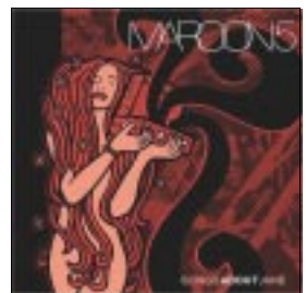
MAROON5 Songs About Jane Octone (50001)