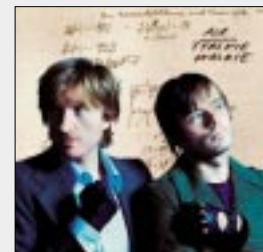
All I Need Is The Air To Breathe (72 - 4*)

W hile 'W' spouts election-year visions of launching a multi-billion dollar program to get our ass to Mars, the only celestial-named entity in our universe that's acting the least bit grounded is Sun Kil Moon , which continues its impressive reign at No. 1. Perhaps the only way a Mars visit would be acceptable is if NASA promised to take Kid Rock and KoRn with them. (Ya'all want a single? Fuck that, indeed.) Until that happens, however, perhaps we should fix Earth first? Speaking of things earthly, Air made one giant leap into the Top 10 this week, moving 72-4*, while John Vanderslice (129-5*) and Phantom Planet (49-6*) make impressive entrances, as well. Now that we're knee-deep into 2004, the peak of the Radio 200 chart is about to undergo a major facelift; look for the Mountain Goats' We Shall Be Healed (89-10*), Ani DiFranco Educated Guess (114-11*) and The Mekons' Punk Rock (126-13*) to try to muscle their way to the top. Meanwhile, Telefon Tel Aviv's Map Of What Is Effortless debuts at No. 27 this week, and is obviously one to keep an eye on, as well. Next week, count on Starsailor's Silence Is Easy (D-144*) to make a substantial jump on the chart, after picking up 147 adds. Also on tap for a huge debut is Stereolab's Margerine Eclipse , which is this week's No. 1 Most Added album at College Radio. — Kevin Boyce