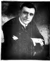
Representative at Washington