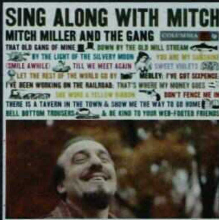
SING ALONG WITH MITCH—Mitch Miller and the Gang. CL 1160