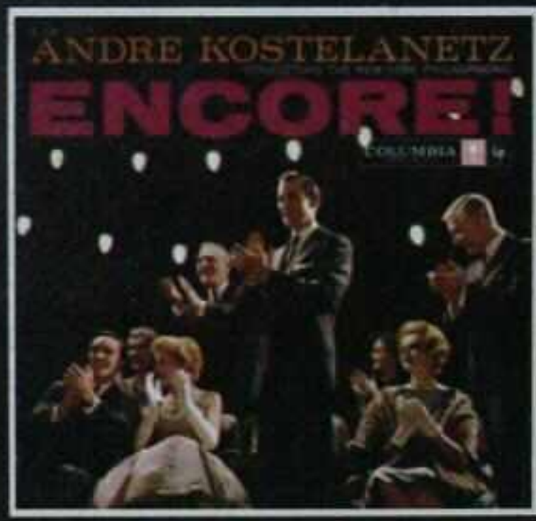
ENCORE! Andre Kostelanetz conducting the New York Philharmonic. CL 1135