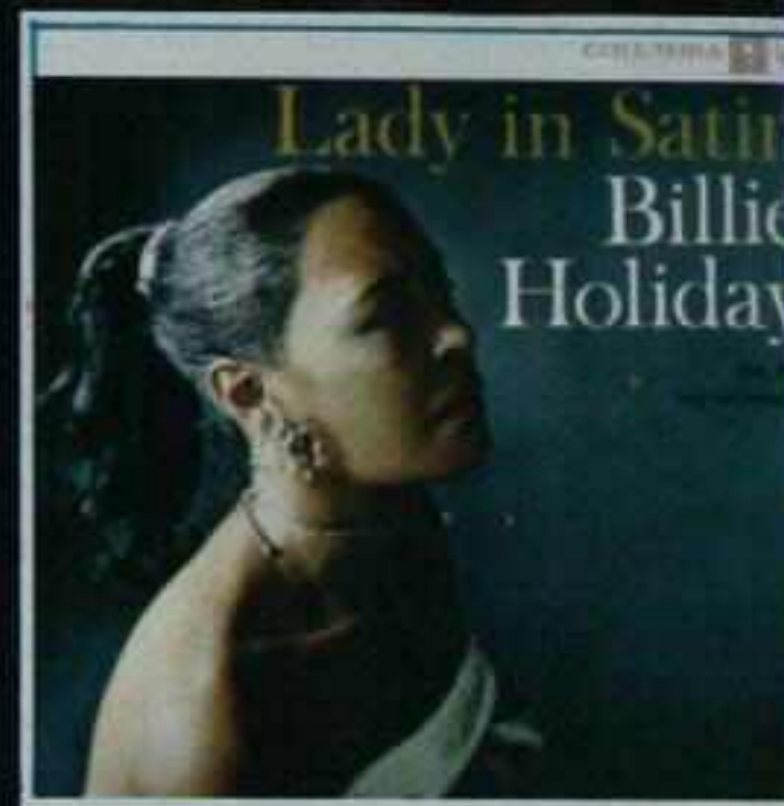
LADY IN SATIN Billie Holiday with Ray Ellis and his orchestra. CL 1157