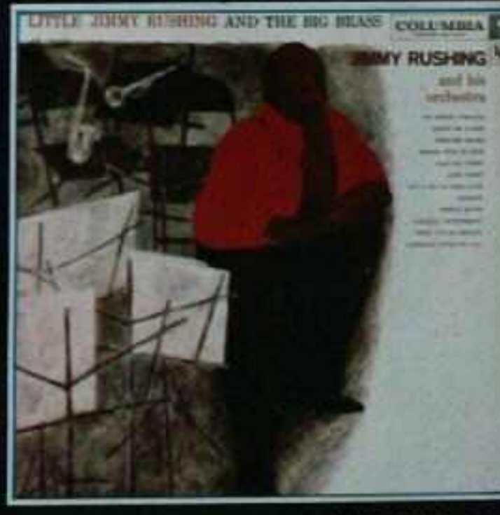
LITTLE JIMMY RUSHING AND THE BIG BRASS—Jimmy Rushing and his orchestra. CL 1152