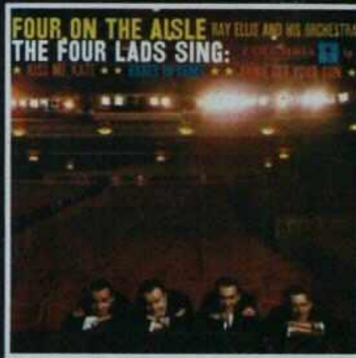
FOUR ON THE AISLE—The Four Lads with Ray Ellis and his orchestra. CL 1111