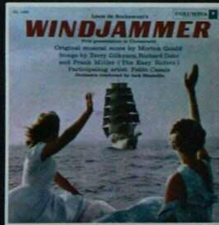
Louis de Rochemont's WINDJAMMER CL 1158