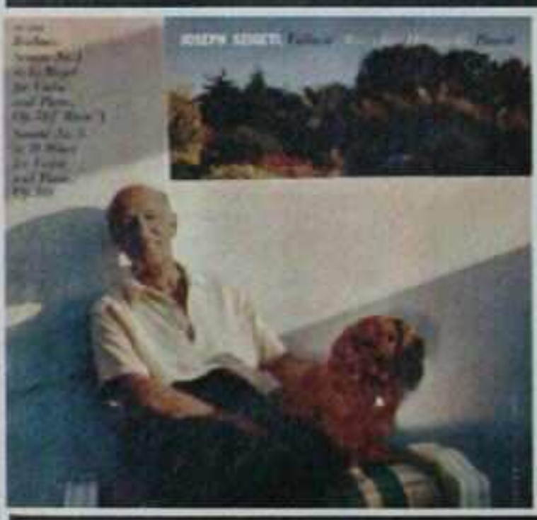
BRAHMS: Sonata No. 1 in G Major for Violin and Piano ("Rain") Sonata No. 3 in D Minor for Violin and Piano—Joseph Szigeti, violinist; Mieczyslaw Horszowski, pianist. ML 5266