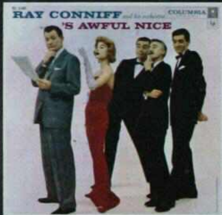
'S AWFUL NICE—Ray Conniff and his orchestra. CL 1137