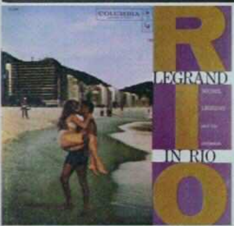
LEGRAND IN RIO—Michel Legrand and his orchestra. CL 1139