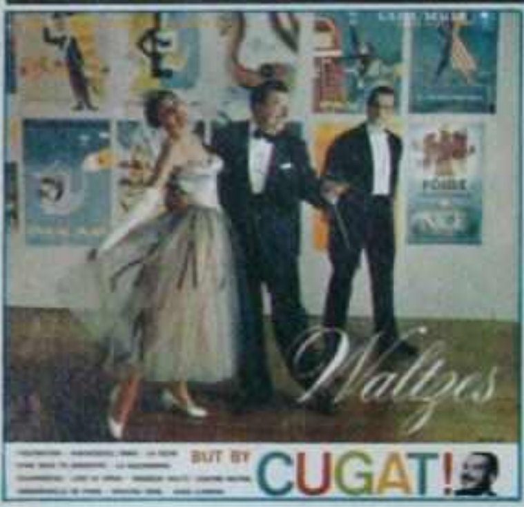
WALTZES—BUT BY CUGAT! Xavier Cugat and his orchestra. CL 1143