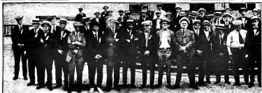
This picture, taken by The Billboard at Photographers Charles P. Allen, shows officers and delegates of the International Alliance of Billboarders... This picture, taken by The Billboard at Photographers Charles P. Allen, shows officers and delegates of the International Alliance of Billboarders...