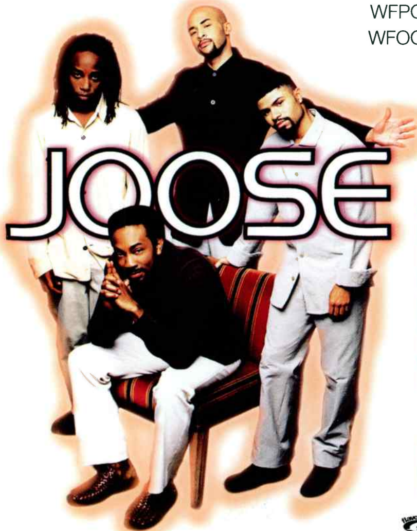
On Flavor (left) EastWest Records America compact discs and cassette. www.elflavor.com