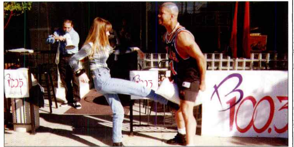
KIBB (B100) Los Angeles understands your frustration with Chicago Bulls diva Dennis Rodman . Following his groin-kicking incident, B100 talked some poor bastard into dressing up like Rodman and letting listeners line up to return the favor.