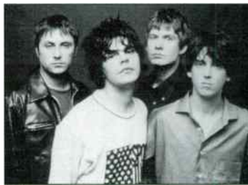
From left, Jon Brookes, Tim Burgess, Martin Blunt, Mark Collins

Despite its homeland success, the band's relatively lower profile in the U.S. can be partly attributed to revolving-door licensing arrangements made for the group by Beggars Banquet, the U.K. label that signed the then Charlatans in '90 and has released all its sets in the U.K.