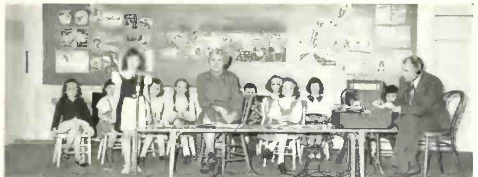
Second graders at Moseley School record Fire Department Program on Yellow Label Audiorecorders.

Much has been written concerning the virtues of using the recorded voice in the high school—for language study, speech, English, dramatic, and similar classes, sometimes to the point of minimizing the effectiveness of the device in the elementary school. However, the function of the disc recorder as an aid in early speech correction, oral reading, music, social studies, and as an excellent motivator in all phases of the elementary school curriculum is gaining added impetus throughout the country as the emphasis on the unit-activity method of instruction continues to be