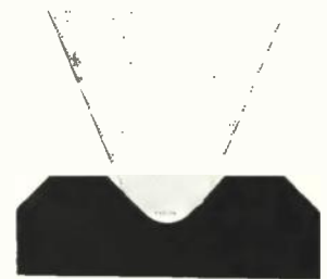
Fig. 1 Stylus-Groove Relation for Proper Tracking

1. Reproducing stylus tip must be positively coupled to the groove walls. Such positive coupling can be achieved by having the spherical portion of the stylus tip ride on the straight side walls of the groove. This is easily achieved, when desired, by using a slightly larger radius for the reproducing stylus tip than was used for the cutting stylus tip. Incidentally, this mismatch increases the unit area pressure on the area in contact.