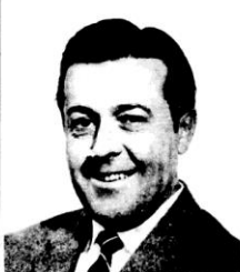
JOHN FORD NEWSBEAT and SPECIAL EVENTS