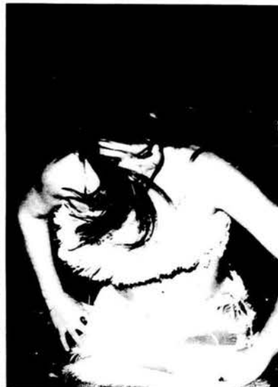
I'M A GO-GO GO-GO GIRL