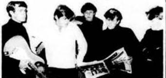
THE LYNX From Benalla — at New Palais, Albury

After becoming used to the Capital City scene where there are dances for Mods and dances for Rockers, etc., it was an enjoyable surprise to find everyone under the same roof all dancing with styles varying from the new Mod dances through living to where couples DANCED WITH EACH OTHER! There were soldiers (shortest of the short hair), mod boys (longest of the long hair), there were farmers, kids home on school holidays; out the front there were motor bikes, sports cars, trucks, jeeps, even the odd Rolls-Royce (with sheep dog), for sure a sight never seen at any Melbourne or Sydney dance. But then I guess that perhaps the country city-ites know one thing or two — some City-ites don't — and that's how to get along together!