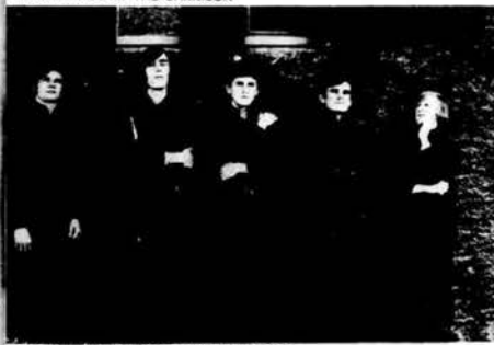
LOST SOULS' JAK "STARSEEKER" WINNERS