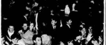
CROWD: Mods, Rockers, and all!