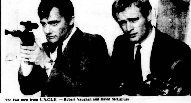
The two men from U.N.C.L.E. — Robert Vaughan and David McCallum

of the city which all stars' homes are supposed to have. For relaxation (when he can get it) he travels through the U.S. meeting and talking with the people rather than merely snapping pictures of the great outdoors. Other McCallum personality tit-bits include fine wine with dinner, being an early riser (even without benefit of an alarm clock); golf — but he doesn't get to practice very often; and amateur photography.