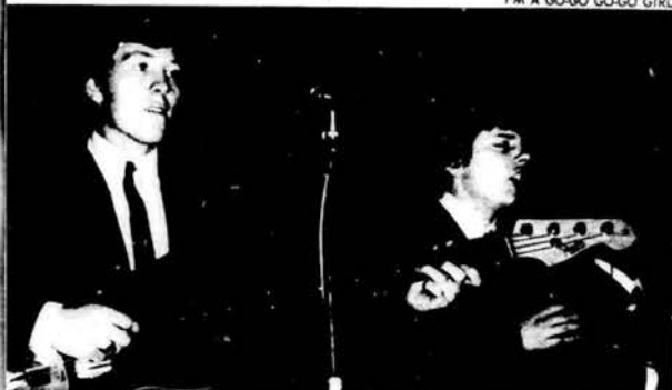
JACKSON KINGS AT THE GARRISON