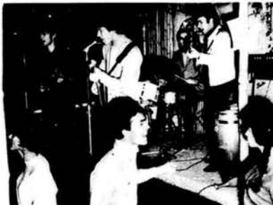
MAX MERRITT AND THE METEORS AT SYDNEY'S HAWAIIAN EYE