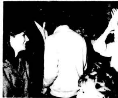
AU-GO-GO AT THE PICCOLO