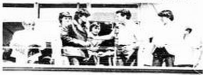
YOU-KNOW-WHO READS GO-SET ON 3UZ BALCONY

question at the moment is which new discotheque will be granted by the Kink's presence and which dances would like to book them at $800 a spot. After all Normie Rowe charges only $400.