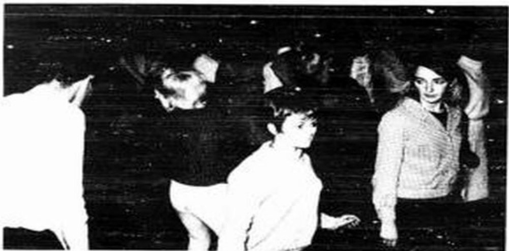
AT SURFRIDER CHARITY NIGHT