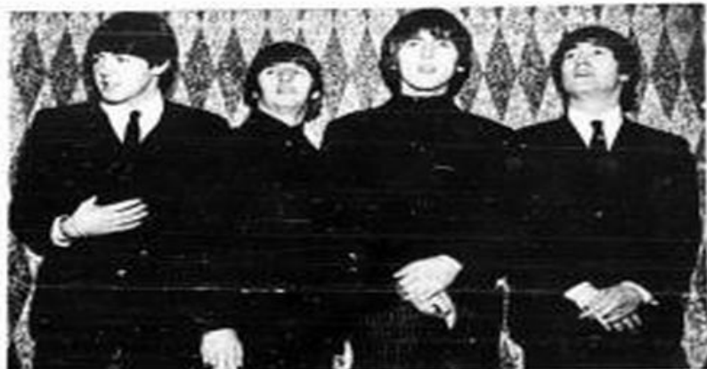
They could be back on our shores 'round about May this year! Here's hopin'!