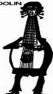
GREG ADAMS 7 Reserve Rd., Beumaris