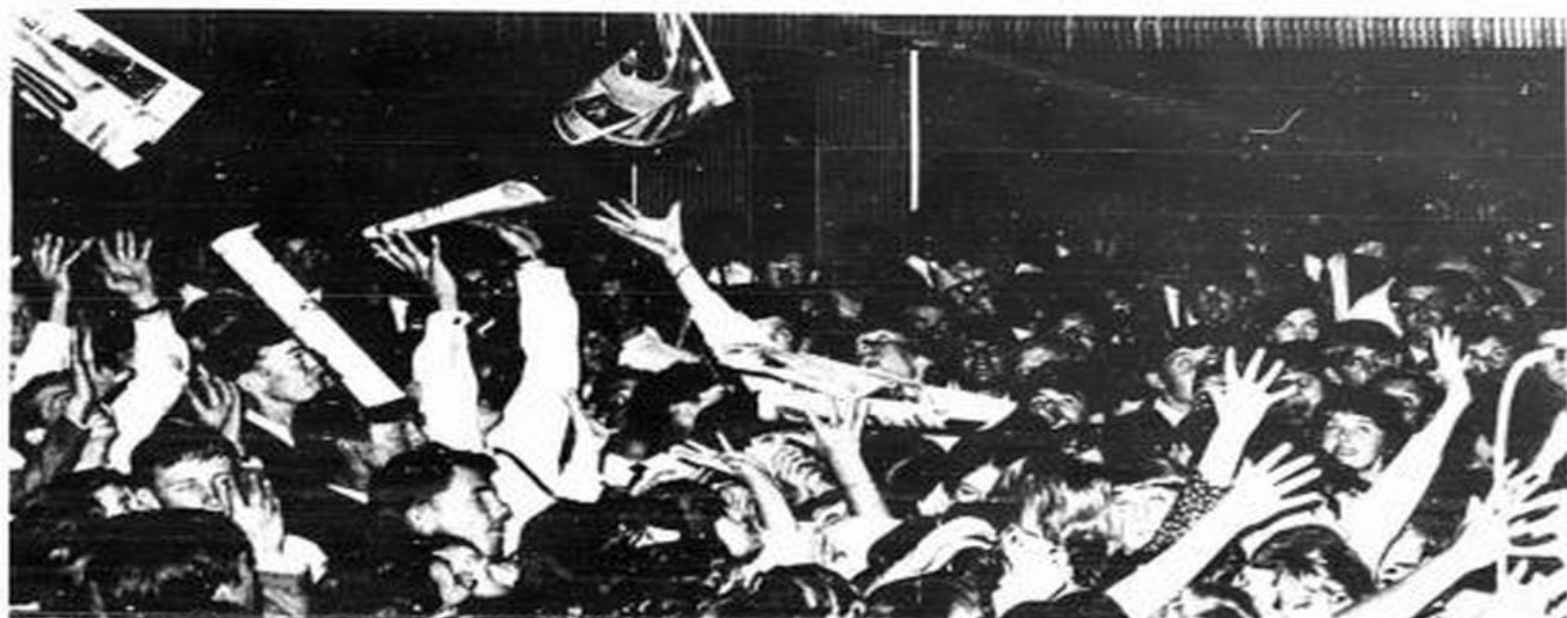
CROWD GOES FOR GO-SET AT "YOUNG WORLD" SHEPPARTON