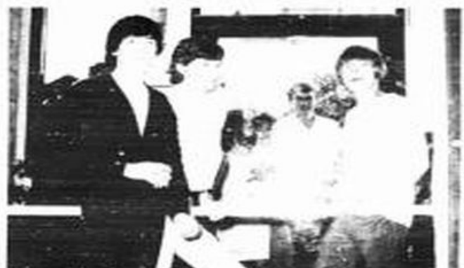
STONES AT THE JOHN BATMAN INN