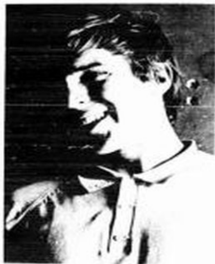
NORMIE ROWE AT FESTIVAL HALL