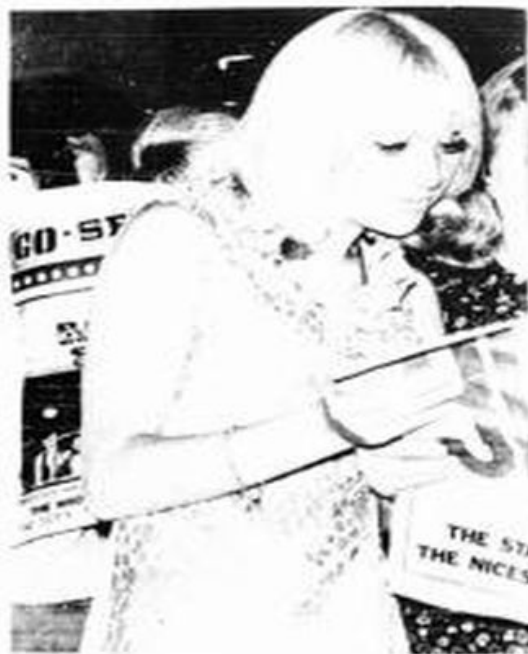
SEEN AT SHEPPARTON