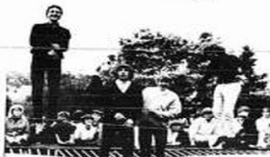
CHEROKEES AT FAN CLUB PICNIC — EMERALD LAKE