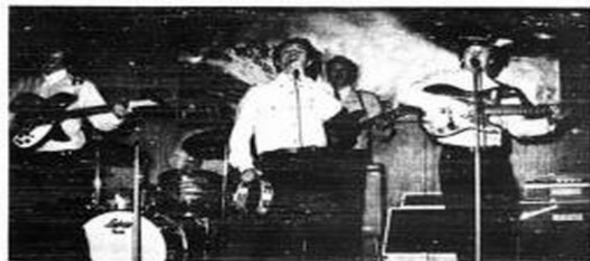
MIDNIGHTERS AT SURFRIDER