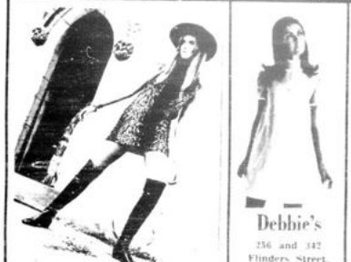
Debbie's 236 and 142 Flinders Street, Melbourne