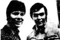
• John Rowles congratulates John Rowles on his debut on the English charts with "Congratulations"

Says John: "I only decided I could sing about three years ago. That's when I started to take it seriously." However, John left college in Australia and finished that the only way to further his career was to go to Britain, which he did in October last year. Many people have commented that he bears a resemblance to England's Englebert Humperdink. John agrees to a certain extent and says that on his first day in the London while looking for a full-time job, he saw three young girls run up to him in the street and say "Congratulations"