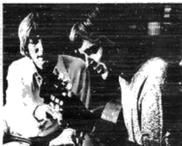
● They've had the basic idea for the song in their heads for a while, and now it has to be carefully worked out.