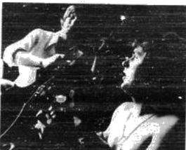
● Play that cello bit again, yeah that's the sound we wanted!