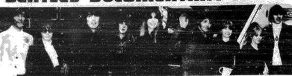
En route for meditation instruction from the Maharishi, the Beatles leave London airport. Left to right: John and Cynthia Lennon, George Harrison, Jenny Boyd, sister of George's wife, Patti, Paul McCartney, Jane Asher, Maureen and Ringo Starr.

The Beatles have been shooting vast amounts of material in India, after only a 10-day stay in India. The group is expected to return to London in the next few days. The group is expected to release a new album in the next few months.