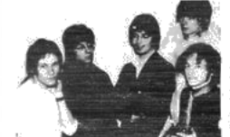
Manfred Mann group members in New York last week to promote their new album, "Mighty Quinn".

The Manfred Mann group is due to visit America in a tour to promote their new album, "Mighty Quinn". The group will be performing at the New York City Music Hall on March 22.