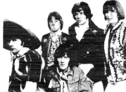
The Dave Dee group in fancy "Xanad" gear. Doxy, Tich, Mick, Dave and Becky.