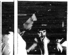
● Frustrated, they aren't really on their minds, but some fruit to keep him going.