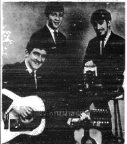
* Top folk group The Twilliers, will be appearing with Marlene Dietrich, as the only associate artists, at Melbourne's Princess Theatre, for a week from March 23rd.