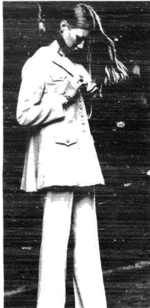
Slickly tailored trouser suit by Kenneth Pirrie. Available in bone or camel at just $48, at the On Shoppe Imperial Arcade.

— for taking Sunday strolls down Argyle way — the brave and breezy bold ways of looking dynamic in wool on a sunny autumn afternoon.