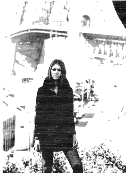
Zip-fronted, coat-dress by Leroy in black only. Price $45, and available at the On Shoppe, Imperial Arcade.