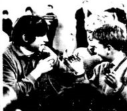
One of the most rewarding afternoons I have ever spent was at the school for blind children in Burwood, Victoria.