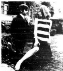
My first and only attempt at modeling was for Go-Set.