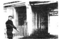
For nearly 11 years I went in and out of this doorway. One of my happy homecomings.