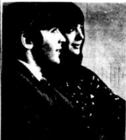
Another secret love affair. Ho Hum.