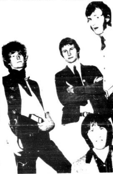
● THE BAY CITY UNION WHO ARE NOW A FOUR-PIECE GROUP

Is the Wild Cherries Alice Is? Well, who is? This is a bit tricky. It's admit, but for the brilliant trio of Brisbane University students who are producing the show "Alice Is" at Brisbane's Avon Theatre from Feb. 13 to March 16, it's simple. (Which in next week's Go-Set for the mystery of Alice Is, the Wild Cherries unravel the problem!)