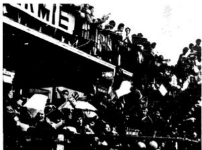
The way it looked from the plane when I arrived back. I was so glad to see so many of you there.