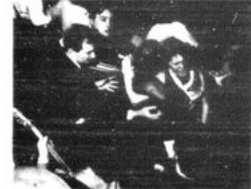
One of the many wild True shows I did.