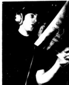
Who said I couldn't read music? You're dead right I can't.