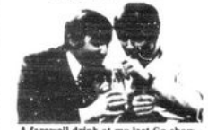
A farewell drink at my last Go show.