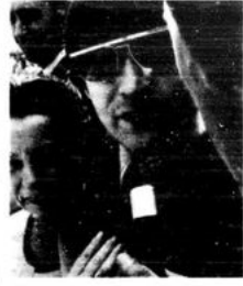
My favorite person, without whose help I would never have my wonderful career — my mum!