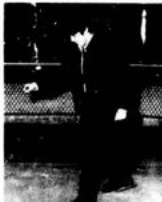
It didn't take me long to get a wet behind at the Silver Blades Ice Rink in Birmingham, England.