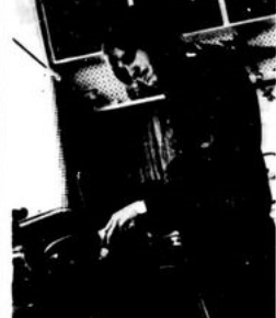
Although I bought the new house, mum and dad made me wash the dishes as well.