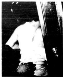
I felt very homesick after this scene where I was mobbed in Liverpool.