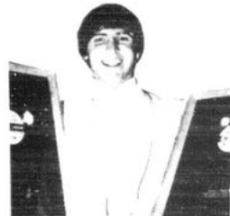
One of the happiest moments of my life was when I received my second gold record for 'Que Sera Sera'.