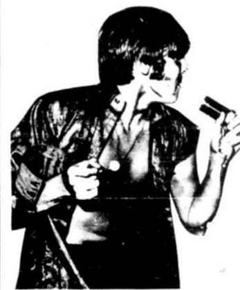
The scene was supposed to have calmed down when I arrived back, but my shirt wasn't designed with only one sleeve!