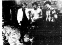
The Playboys as they were when we went to England.