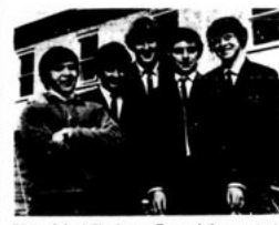
The original Playboys. Four of the greatest guys there ever were. Helped me a lot in my career.