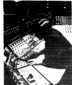
While in England production of records became one of my interests.