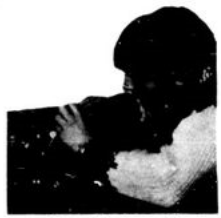
Before I took up photography, slot cars were my big hobby.