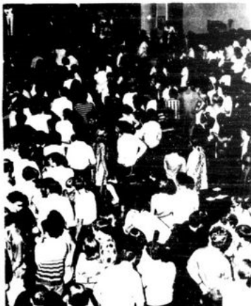
Here's a big gang shot from the balcony of SWINGER at Coburg Town Hall.