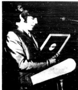
That day at the Wentworth. The gold record for 'Ooh La La'.