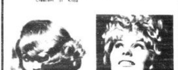
The Thomas look the latest... Lyns says this is a big new hair set

The Little Boy Look... Send your entry to ELECT, c/o 2 Linnwood Crescent, St. Kilda