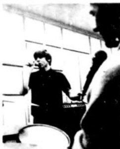
The Gene Pitney tour of England was a great experience for us. Here we are at rehearsals.