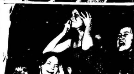
Just a few of the tearful girls who were knocked right out by the whole mind-bending scene.