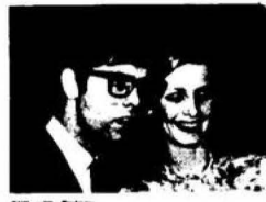
Cliff with Terry

This may come as a surprise, but in Go-Set's opinion Cliff is the best. Cliff has been on the pop scene for many years, yet he still retains the warmth and understanding of teenagers. "The Day I Met Marie" undoubtedly put Cliff in this winning position.