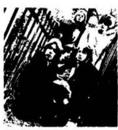
Blazers — A baby polar bear.