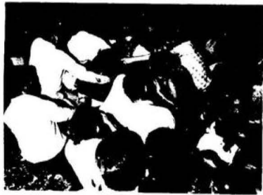
Frantic bouncers attempt to recover the fabled head (and body) of Ronnie Burns lost in the crowd.