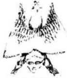
ADDERLEY SMITH BLUES BAND 15 50 800 878 3040

DANCE DECORATING Psychiatric Lighting a specialty! Ultra violet and all types of decorative lighting supplied, installed and connected to dances, parties, barbecues etc. SMITHS ILLUMINATING 448 ST. KILDA RD.