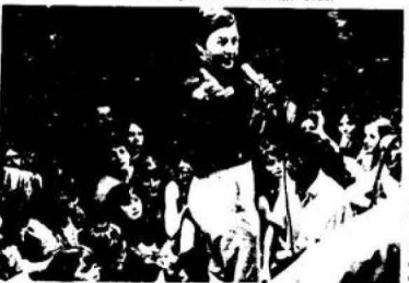
The Cherokees twist and shout on stage in their act that could become known in the U.S. shortly.