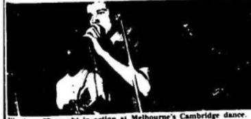
Nineteen 87 caught in action at Melbourne's Cambridge dance.