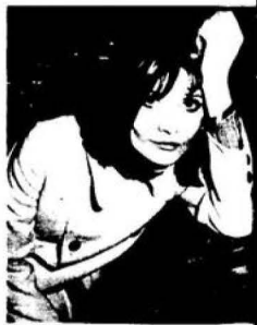
• Sandie Shaw

As soon as she completed an engagement at London night club, Talk Of The Town, she will go to hospital for an abdominal operation.