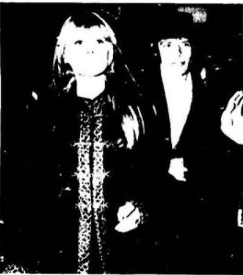
• Marianne Faithfull and Mick Jagger

The Procol Harum are currently touring, they played at Opera House in January they have a new single and a new album.