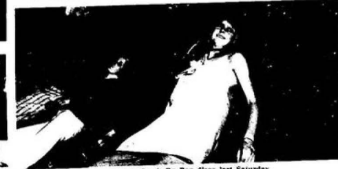
Seen under the stroboscope at Sydney's Op Pop disco last Saturday.