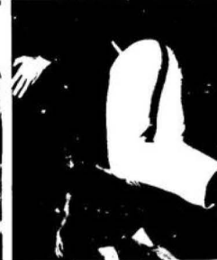
This groovy study in legs and arms was taken at Long Johns (Kings Cross), last weekend.