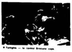
Twilight — In control Brisbane cops.