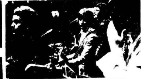
The fabulous Twilights on stage at the recent ZUV Trocadero Spectacular.