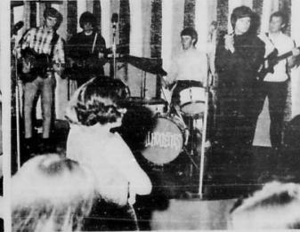
● Silhouettes at Adelaide's "Scene"