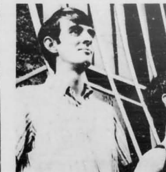
● Grape Escape

At the end of the month their first record