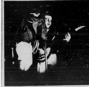
● Two of Brisbane's "4 of the 11" group