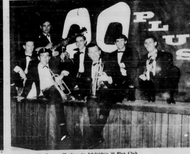
● The Livable Brass adff class at Adelaide's 30 Plus Club