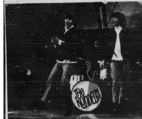
● ABOVE: Australia's top pop-duo as they appeared on their highly successful TV show "Big We Meet" ● BELOW: Twelve months ago at Bobby's birthday party toasting the year to come.