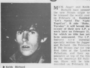
● Keith Richards