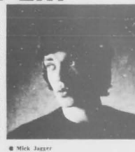
● Mick Jagger

Mick Jagger and Keith Richards have penned the new Stones single to be released the world over on February 14. Entitled "Let's Spend The Night Together", it is the lead single of their new L.P., a new LP which will be released on February 21, for which no title has yet been named. The L.P. features new material specially written by Jagger and Richards. On February 22, The Stones star for the first time at the London Palladium, and their appearance as top of the bill on the American Ed Sullivan Show will be telecast on February 14.