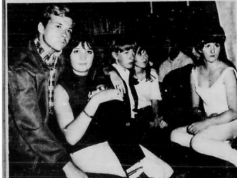
● Seen at Sydney's Blue Note discotheque