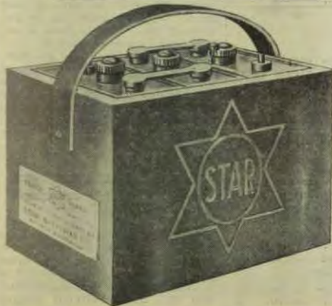
"Hitch your Radio to a STAR."

We manufacture Special Radio Batteries (both "A" and "B" type).