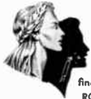
finest tone system in RCA Victor history

Plays on AC or DC house current or on its long-life RCA battery. Lightweight—in durable maroon plastic with non-tarnish golden finished trim and a handsome saddle of smart luggage-type covering. It's a welcome companion at home or wherever you go! $34.95* less battery.