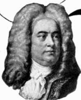
George Frederick Handel