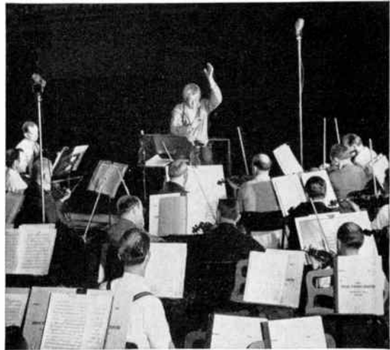
Rodzinski and the Chicago Symphony Orchestra record.

This is the first in a series of splendid recordings made by Rodzinski and the Chicago Symphony Orchestra for RCA Victor in the latter part of 1917. It is only the beginning of some wonderful music that will be coming your way in the near future!