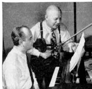
Mischa Elman and Wolfgang Rosé

The famed Elman tone, brilliantly showcased in a recent release of the Mendelssohn Violin Concerto, is on display this month in two short poetic works by Bohemia's most beloved composers. The Slavonic Fantasy in B Minor is based on Dvořák's well-known Songs My Mother Taught Me , while the Smetana number is one of a series of captivating pieces composed under the title, From My Home . The magic beauty of Mr. Elman's playing is enhanced by Wolfgang Rosé's superb piano accompaniments. Both of these works belong in everyone's record library.