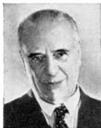
Sir Thomas Beecham, Bart.

RCA VICTOR NO. 12-0239 $1.25 List Price ▲