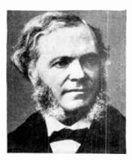
César Franck JULY, 1947

The composition of Psyché dates from the period (1887-8). It was originally conceived as a symphony for orchestra with chorus. But in