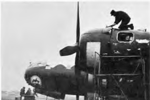
Air Force ground crews are assigned to keep specially-equipped B-29s in operating condition

His important role in the 6023d's Radar Evaluation Flight program is one of which he and the RCA Service Company can be proud. For he is working with one of the weapons in the space-age arsenal of the United States Air Force.