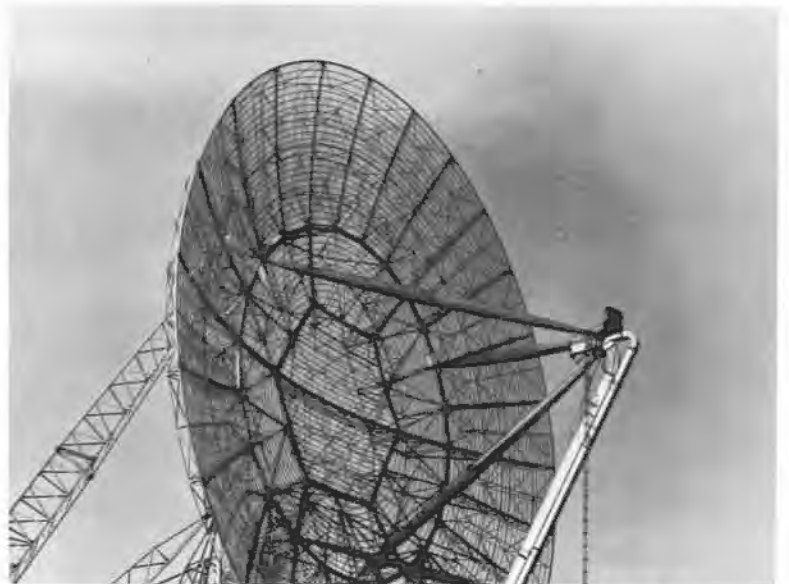
RCA Service Company field engineer puts last touches on a 60-foot antenna at location in icy north