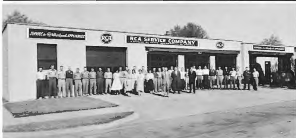
IT TAKES SKILLED PEOPLE—The complete staff of RCA's first all-appliance service branch lines up to show how many people are involved in getting good service to local customers. Represented in this photo are technicians, office workers, and branch supervisors.