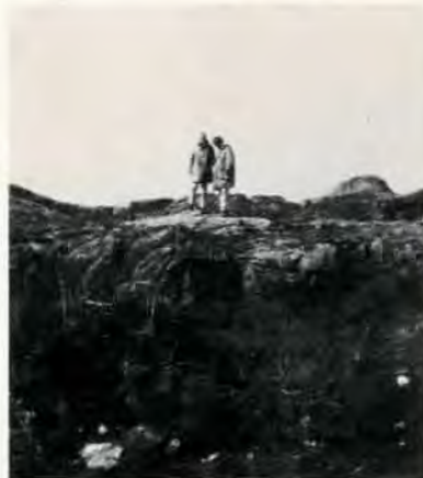
Part of Scatter survey team looks over terrain for Scatter installation in Labrador