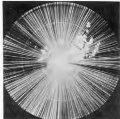
After jamming, radar scope gives a sunburst appearance