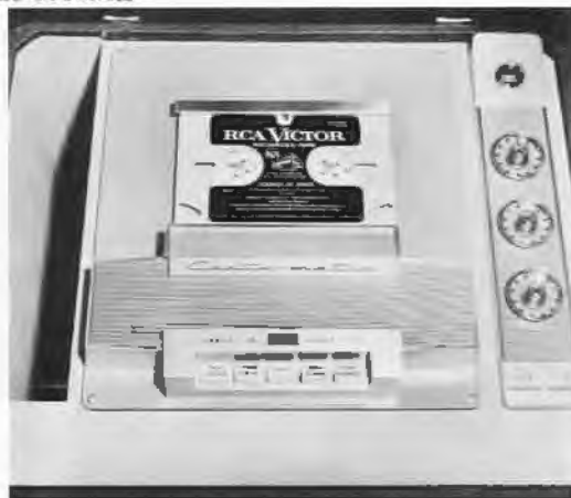
As easy to play as a phonograph record, the new RCA Victor stereophonic tape cartridge slips easily into place on tape recorder-player. The attractive cartridge is one of RCA's latest products