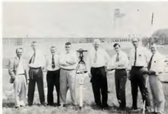
Survey team composed of RCA Defense Electronic Products engineers and RCA Service Company field engineers at Cherry Hill before trip to north