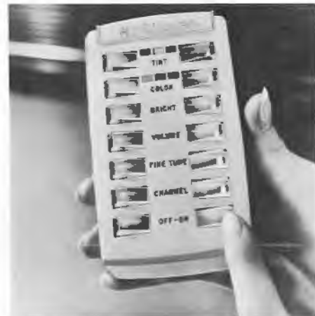
The transistor-powered all-function "Wireless Wizard" for color TV—product of several years of RCA research—is another new item