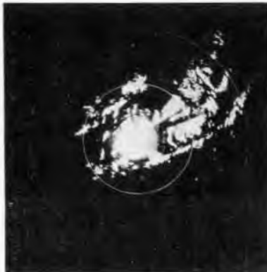
Radar scope looks like this before ECM jamming begins